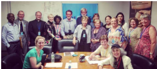
NGO DPI Executive Committee, 2015 UN, NYC, USA

The NGO/DPI Executive Committee was founded in 1962 to create a link between the United Nations and the Non-Governmental Organizations associated with the United Nations Department of Public Information (DPI). It is composed of eighteen Directors and encourages and assists NGOs, as members of civil society, to communicate their interests throughout the United Nations system and to support United Nations' goals and objectives. In partnership with the United Nations Department of Public Information, the NGO/DPI Executive Committee sponsors annual conferences for the